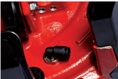
Inspection hatch to check mechanical seal function