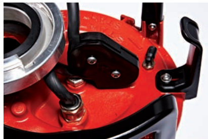
Cable strain relief