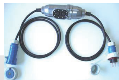
933008 / 933009